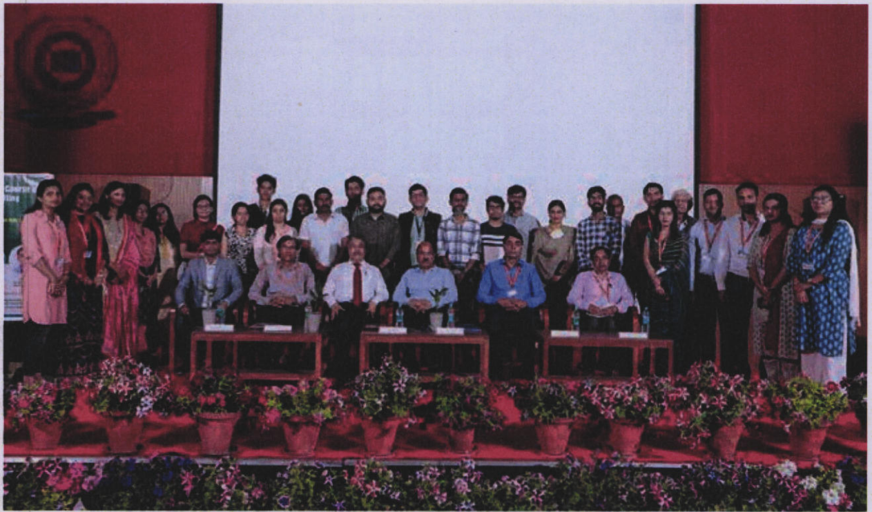
Dignitaries along with the organizers

Budhera, Gurugram-Badli Road, Gurugram (Haryana) – 122505 Ph. : 0124-2278183, 2278184, 2278185