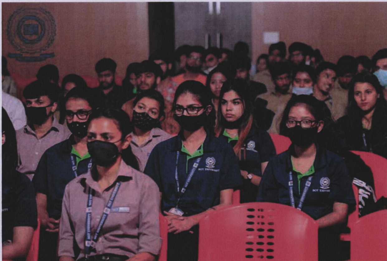
Students attending the session

Budhera, Gurugram-Badli Road, Gurugram (Haryana) – 122505 Ph. : 0124-2278183, 2278184, 2278185