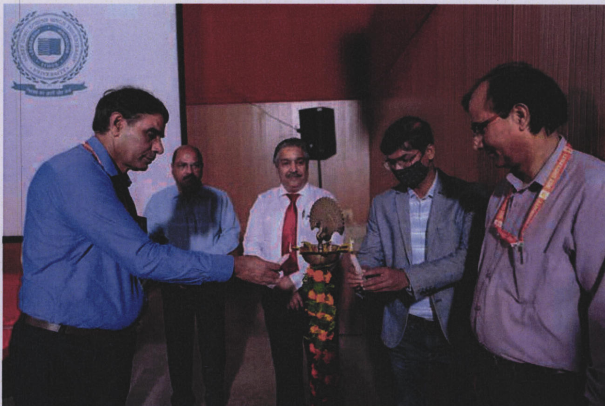
Dignitaries doing the lamp lighting ceremony

Registrar SGT University, Budhera, Gurugram